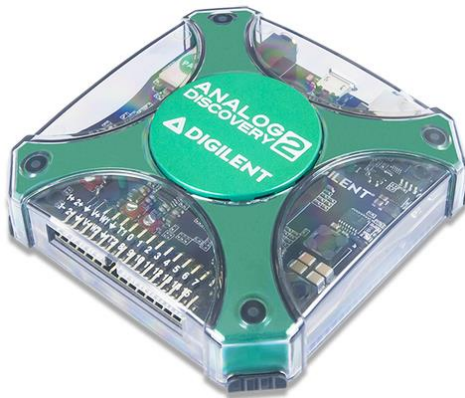
Figure 2 Analog Discovery 2

If doing the experiment at home, use the Analog Discovery 2 (Figure 2) instead of an oscilloscope. Analog Discovery 2 is a multi-function instrument that can measure, visualize, and record mixed-signal circuits. Edge students can download the software WaveForms to your computer and connect the computer to the Analog Discovery 2. They together will work as your “oscilloscope” at home. Analog Discovery has 2 analog channels and 16 digital channels (Figure 3). For this experiment, you can use the digital channels to make things easier as we are snooping digital signals. Connect them to the correct pins on the HAHA Board, add the corresponding channels in the WaveForms software and do the measurement. You can see the manual [3] of this device for more detailed reference.